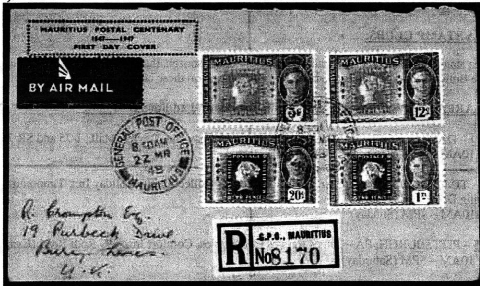
"A 1948 REGISTERED FIRST DAY COVER FROM MAURITIUS TO THE UNITED KINGDOM (ENGLAND) WITH THE 4 STAMP SET (SCOTT #225-228) COMMEMORATING THE CENTENARY OF THE FIRST STAMPS OF MAURITIUS (SCOTT #1 AND #2). CENTENARY WAS 1947 WITH STAMPS ISSUED ON MARCH 22, 1948"

"...AND ALWAYS REMEMBER - COLLECT WHAT YOU LIKE AND ENJOY YOUR HOBBY"